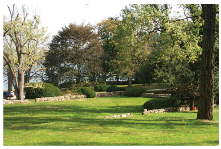
Smith Easement, Nissequogue, conserved November 2006

conservation easement is on the 5.7-acre pastoral and wooded property that includes the home, originally built in 1760. The Danby's, concerned about the ongoing development in their community, wanted to be assured that their property remain in its current state for the sake of the community and wildlife. The Danby's are in the process of placing façade easements on the property's structures.