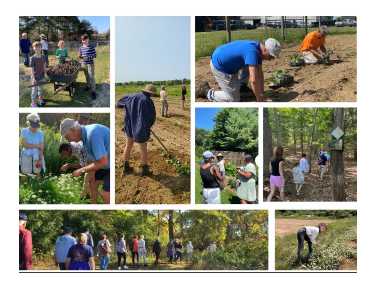
Built to Last: Ensuring a Strong and Enduring Organization

Land and People: Connecting and Growing a Diverse Conservation Community