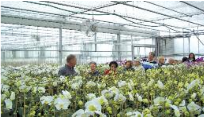
Bianchi-Davis Orchid Tour