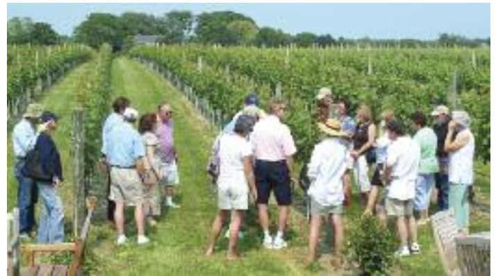
Touring the vines of Wölffer Estate