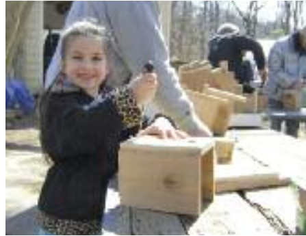
Building birdhouses at Quail Hill Farm