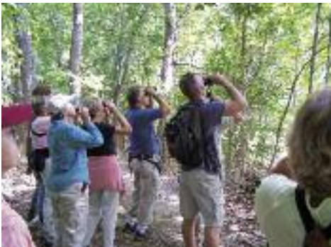
Migratory Bird Walk at Laurel Lake