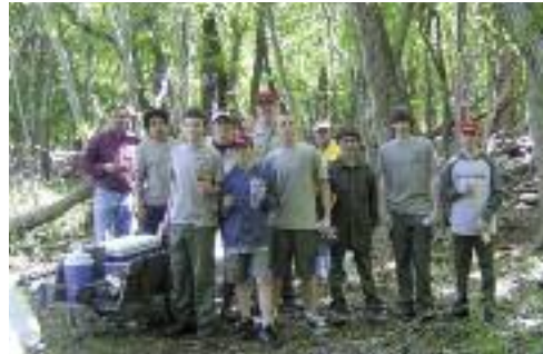
Thornton Smith Preserve Clean-up Crew from Boy Scout Troop 39, Mattituck