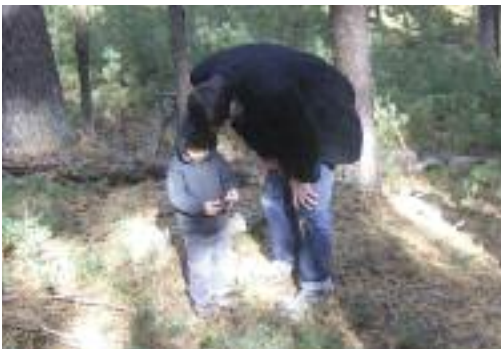
Exploring Wilson's Grove