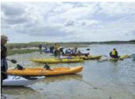
Kayak launch at Scallop Pond