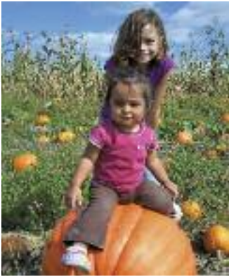
Pumpkin picking at Seven Ponds Orchard