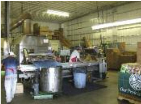
Visit to North Fork Potato Chip Co.