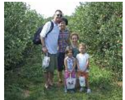
Family Day at Seven Pond Orchard