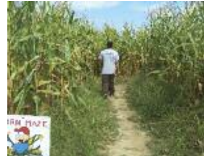
Getting lost in a Corn Maze at Seven Ponds Orchard