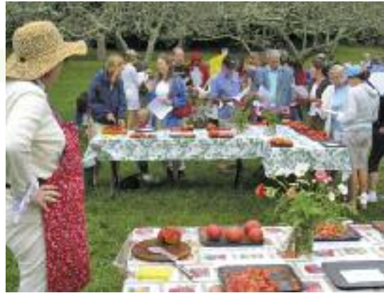
Quail Hill Farm's Tomato Taste-Off 2008