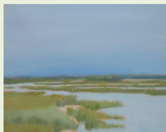
Dune Beach