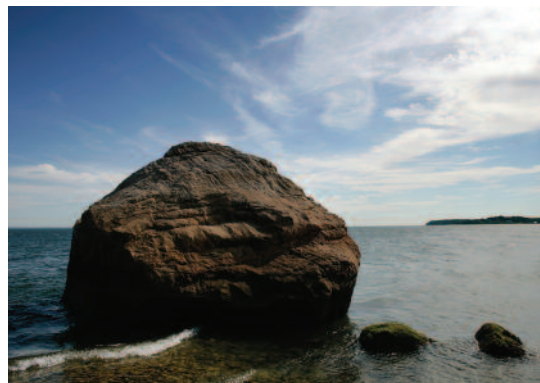
Cove Beach (East Marion)