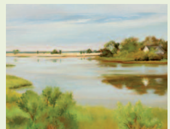
Dam Pond