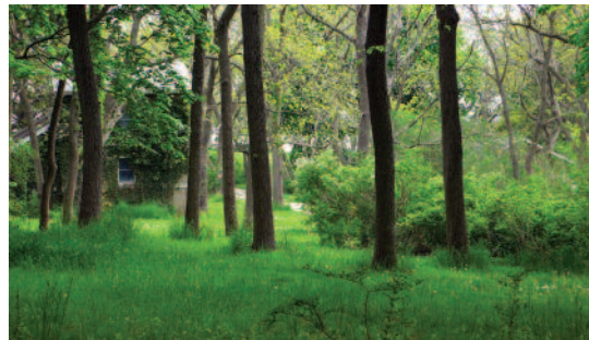
Booth Preserve (Southold)