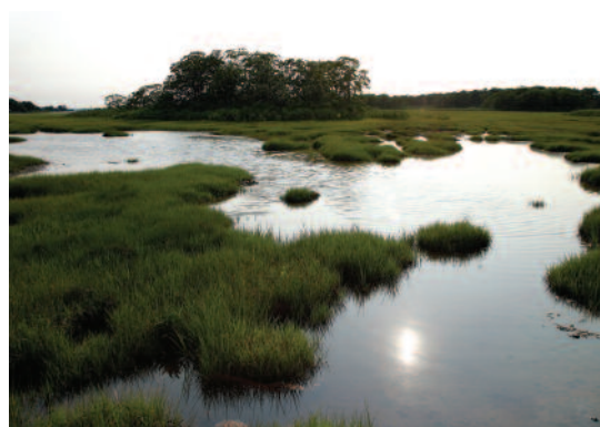
Berglund Preserve (Southampton)