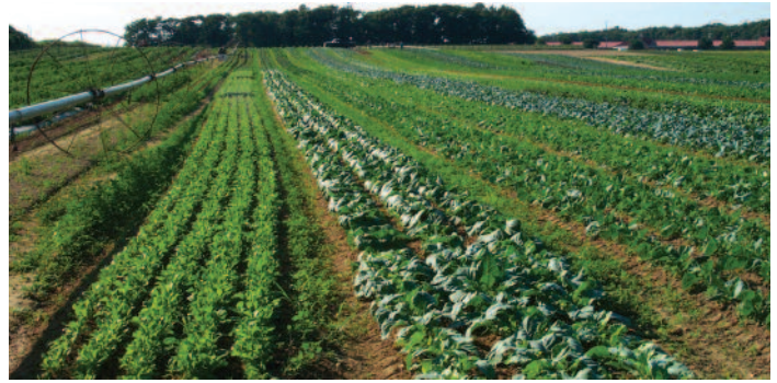
Cox Lane Farm

In June 2007 the Trust received a Conservation Capacity and Excellence Grant from the New York State Conservation Partnership Program managed by the Land Trust Alliance to develop a program that will help to promote more access to affordable and productive