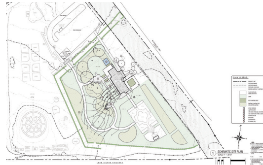
New amphitheater and pathways designed by Araiys Design will improve access to the building and the inner garden.