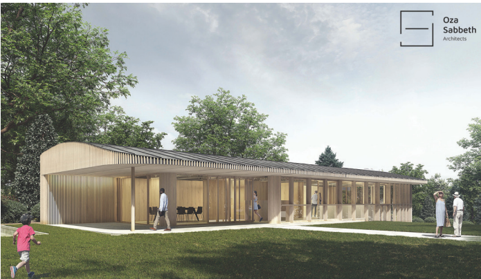
Rendering by Oza Sabbeth Architects includes the extension of the main floor as well as the installation of an elevator and ADA compliant bathrooms.