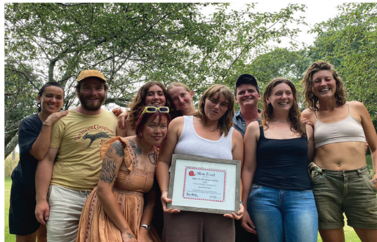
Quail Hill Farm 2023 apprentices and staff with the Snail of Approval Award.

But perhaps most notably, our farm staff developed and launched a highly successful gleaning program, which (with the help of many volunteers) provided