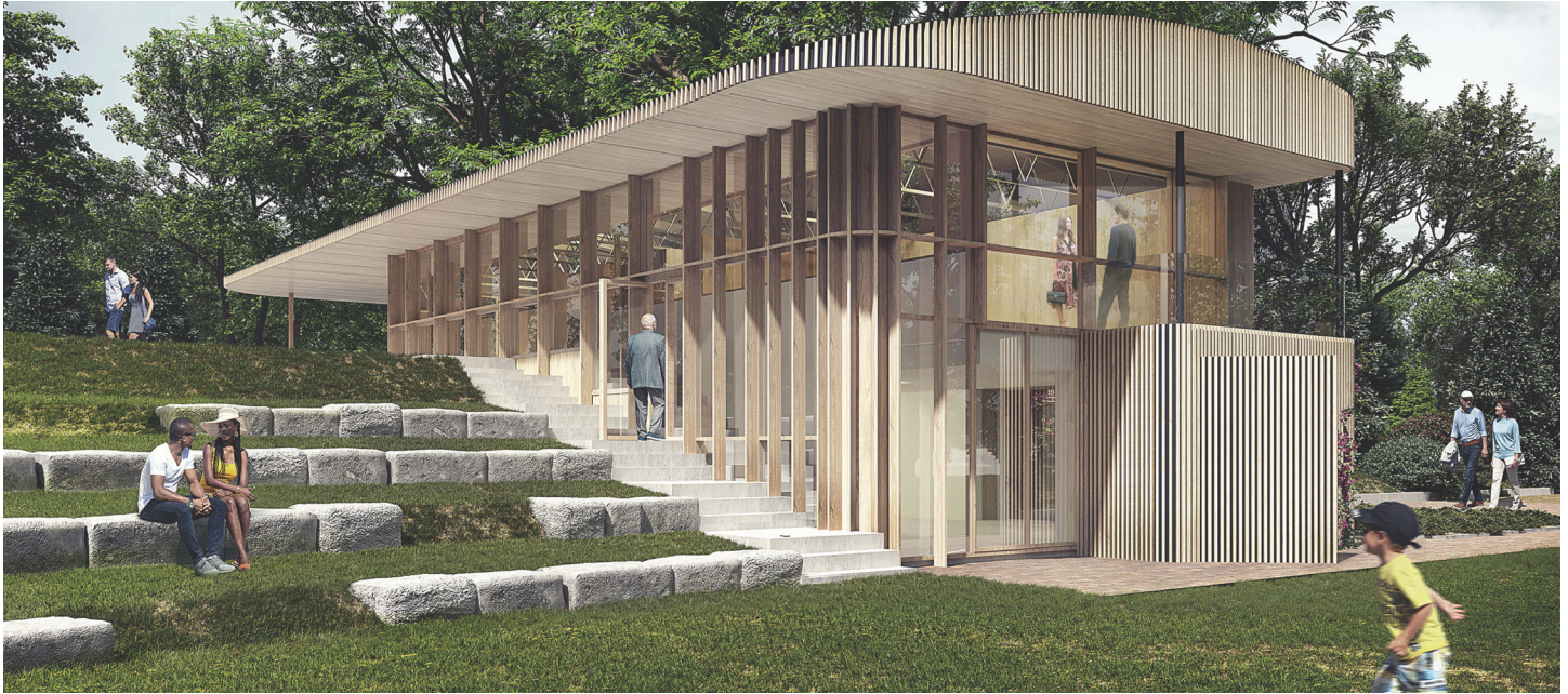
Rendering by Oza Sabbeth Architects showing a new building façade that incorporates sustainable wood siding and an extended roof design to maximize energy savings.