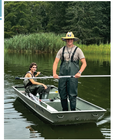
CCE Staff on Georgica Pond.

CCE staff started collecting samples close to the shore and moved further into the pond as the summer progressed. Porewater samples were collected and analyzed on-site for temperature, conductivity, total dissolved solids (TDS), pH, and oxidation reduction potential (ORP). The comprehensive groundwater and porewater survey will identify and rank zones in the pond according to site specific water quality conditions. Once we pinpoint the locations of nitrogen-rich groundwater seepage into the pond we can seek funding for remediation.