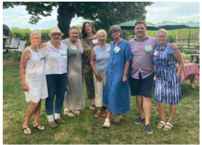
Members of the Deep Hole Creek Steering Committee

The next step for the Deep Hole Creek property is to find a conservation buyer to acquire and care for it in the future. A request for proposals was issued in October.