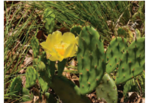
Close Up of Native Opuntia humifusa , also known as Eastern Prickly Pear Cactus

The Trust welcomed Long Island Invasive Species Management Area (LIISMA) and Peconic Estuary Partnership (PEP) to Broad Cove in August. Staff from all three