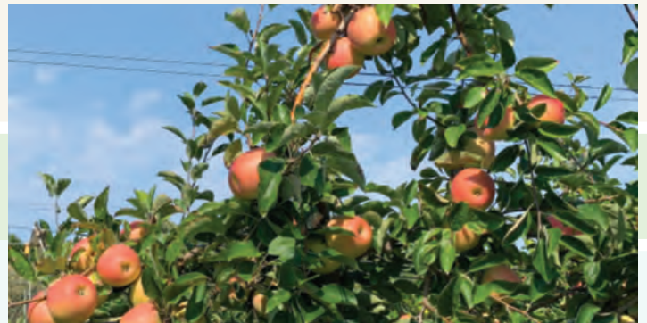
Apples at Whitecap Farm

Throughout the summer, Miller conducted site visits to identify the different kinds of agriculture happening on the South Fork. He also met with farmers to discuss their trials and successes of farming on protected and unprotected farmland. What was supposed to be a 20-minute conversation often turned into 1 to 2 hours