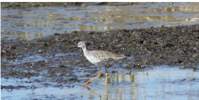
Lesser Yellowlegs

Including 25 acres of tidal wetlands and 8,000 feet of shoreline, the site was found to be an important stopover for migrating birds and great habitat for local breeders!