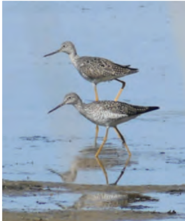
Greater Yellowlegs

When spring finally sprung this past year, a small group of birders took to Broad Cove to document migratory birds. From three separate visits, they spotted over 50 different bird species including the rare Broad-Winged Hawk, Bald Eagle, and multiple warblers.