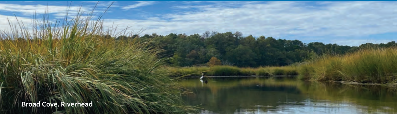
Broad Cove, Riverhead

On the eve of the 40th Anniversary of the Peconic Land Trust, we take time to celebrate all that has been accomplished and acknowledge the support of many throughout these four decades. Truly, without your help, the conservation of working farms, woodlands, hilltops, and shorelines would not have been possible. Throughout, our work has not only focused on the land, but also the people who work the land as well as those who appreciate the importance of protecting it.