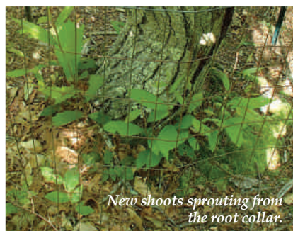
New shoots sprouting from the root collar.