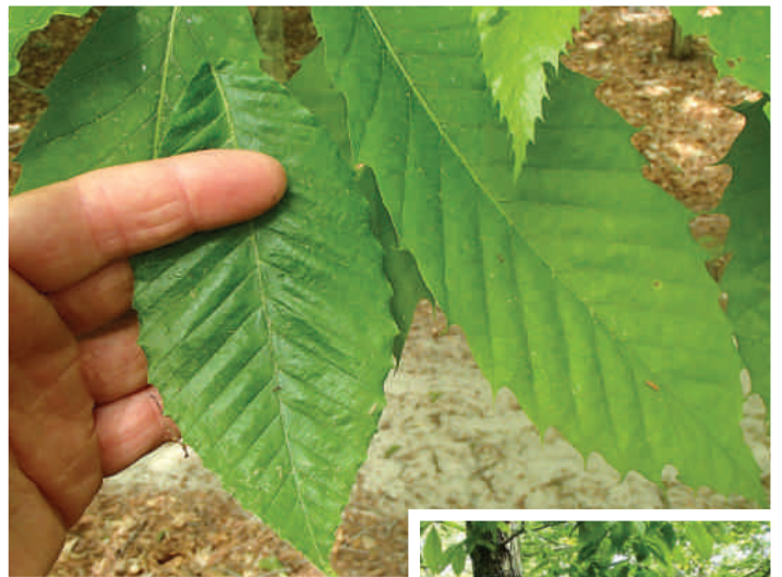
The more common Beech leaf (left) and Chestnut leaf (right). Mature chestnut leaves are approximately the same width but significantly longer and have more pronounced “teeth” along the leaf margin or edge.