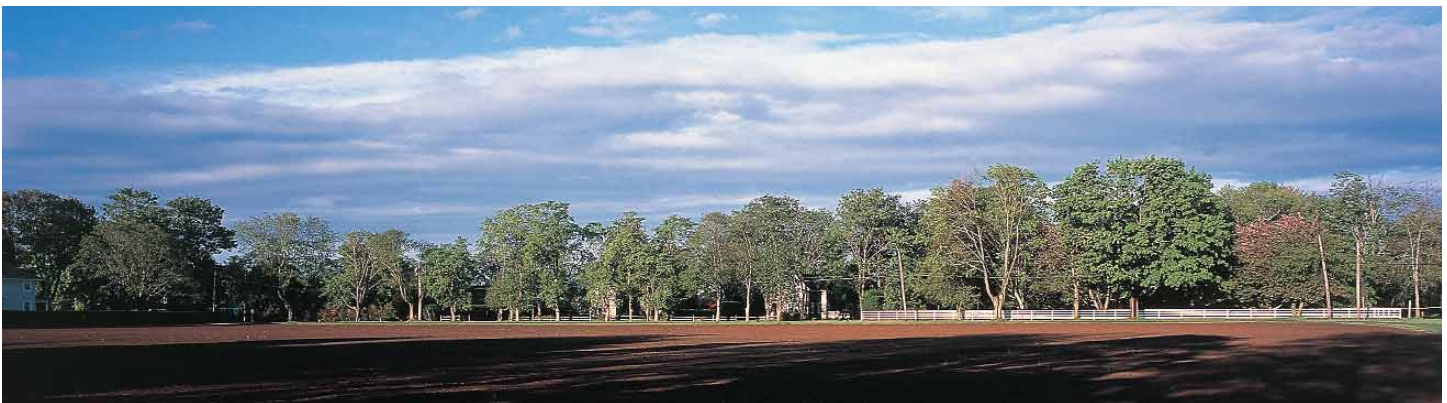
Babinski farmland, Wainscott